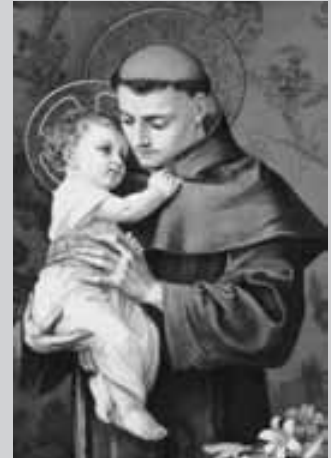
St. Anthony of Padua

Masses: Saturday 5:00 p.m. Sunday 8:30 a.m.